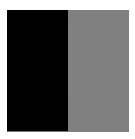
Black or Grey – Abstract GD Topic